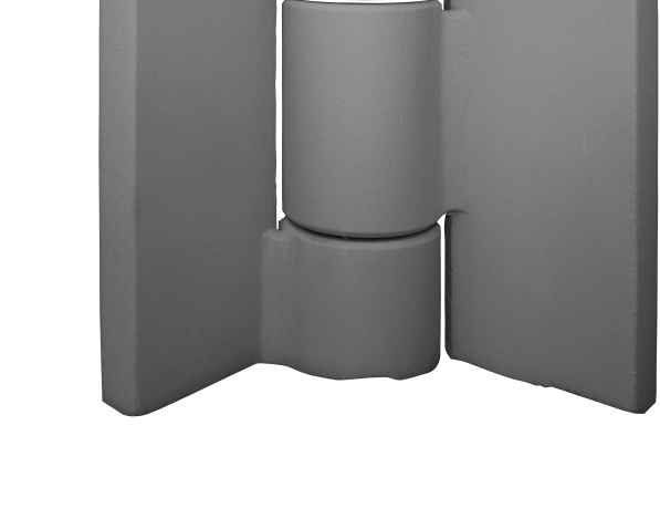
SF 205G: GAP HINGE

NOTE: These hinges are not direct replacements for the Folger Adam #5 Hinge or the Southern Steel 205 Hinge due to barrel size difference.